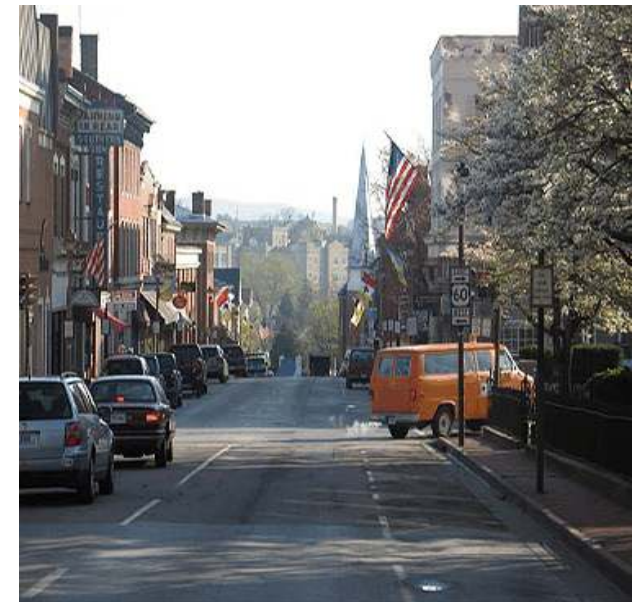
Parking and other information for Downtown Lexington.

WELCOME TO FRIENDLY, SCENIC DOWNTOWN LEXINGTON WHERE PARKING IS CONVENIENT, ACCESSIBLE AND FREE!